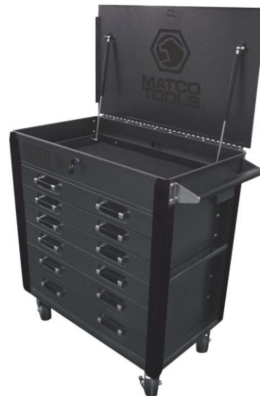
Tool cart available in Blue, Black, Silver Vein and Titanium Grey

For Additional information or to place an order, please contact: